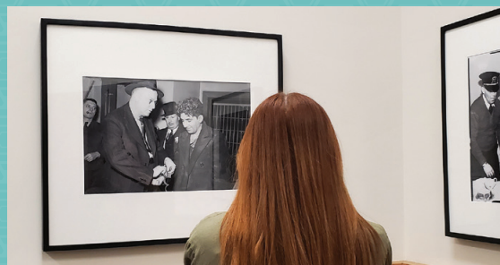
Christmas Day Jailbreak Now - March 9