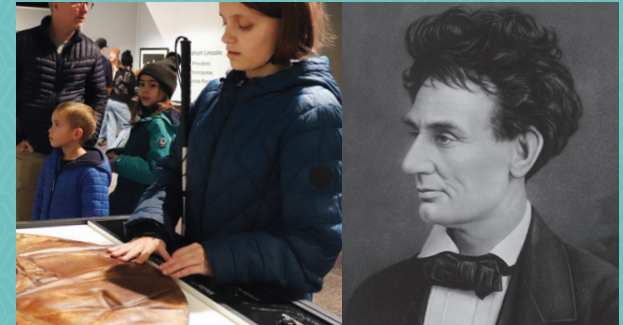
An immersive multi-sensory exhibition

This exhibition was developed by Tactile Images in association with the Nebraska Commission for the Blind and Visually Impaired, Getty Images, the National Federation of the Blind, and the Alliance for Inclusive Design and Experiences (AIDE).