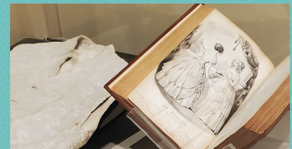
Pastime Print: Graham's Magazine Now - April 6