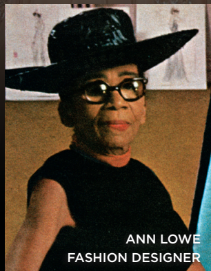
ANN LOWE FASHION DESIGNER

After a highlighted run at the Winterthur Museum, a pair of 1961 Aksarben Coronation gowns are returning to The Durham Museum. Here's your chance to see them for a limited time, April 6 - May 12.