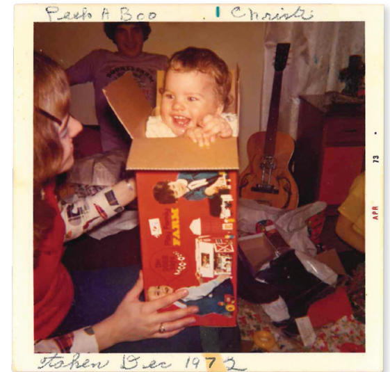
The red barn with mooing doors, and even the box it came in, made for a memorable playroom.