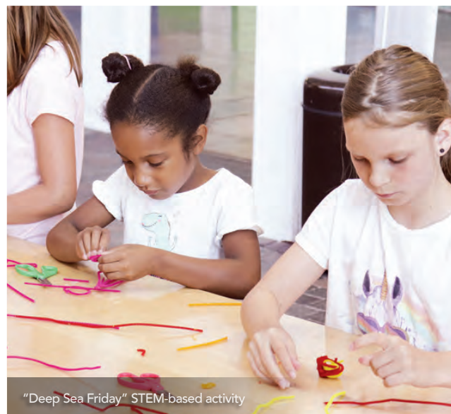
"Deep Sea Friday" STEM-based activity