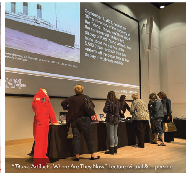
"Titanic Artifacts: Where Are They Now" Lecture (virtual & in-person)