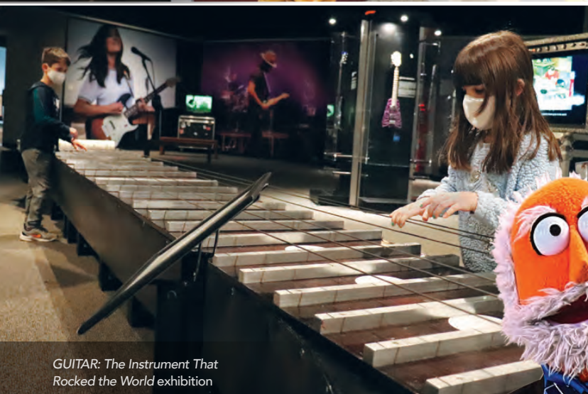
GUITAR: The Instrument That Rocked the World exhibition

After such a challenging year in 2020, The Durham Museum was determined to welcome the community back to Union Station in 2021 as we celebrated our National Historic Landmark's 90th anniversary. Visitors responded by joining in on the celebration—both online and onsite—all year long.