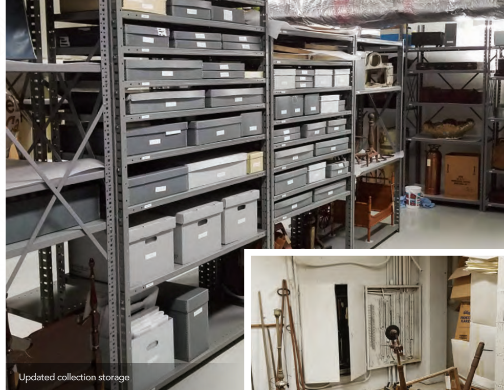
Updated collection storage