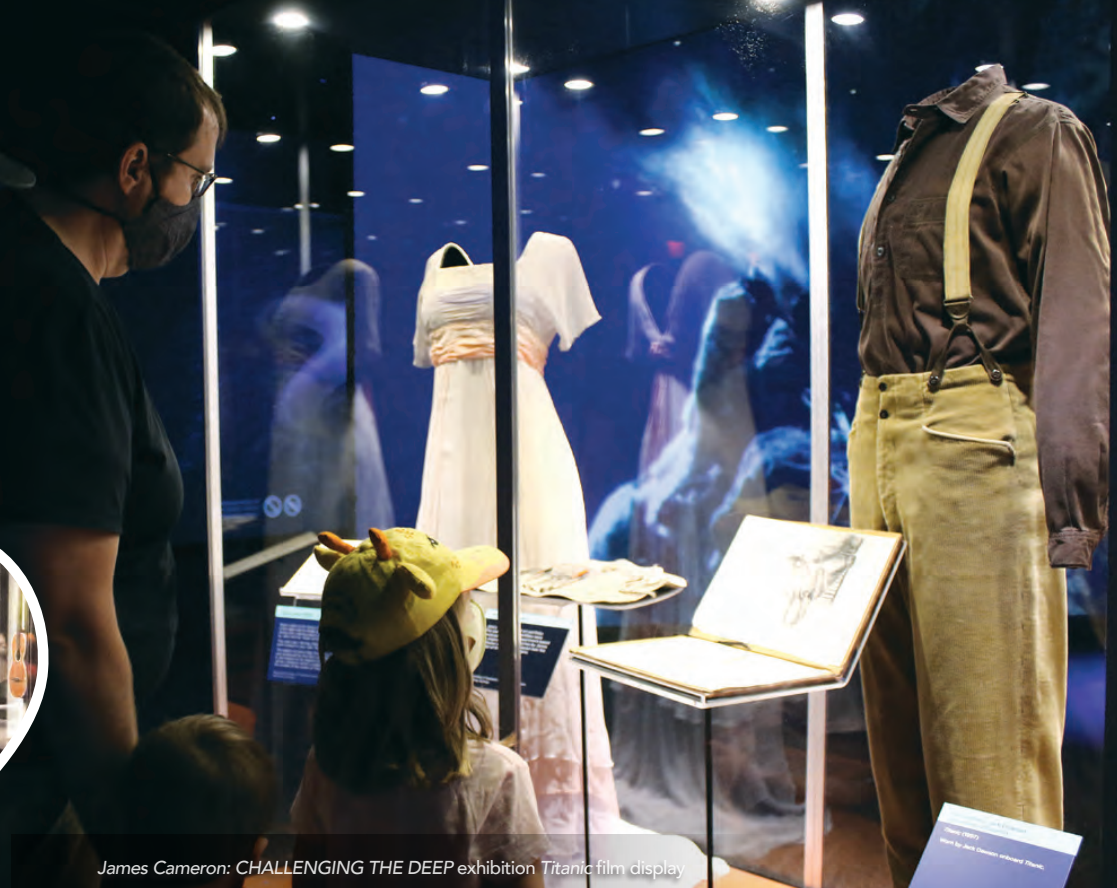
James Cameron: CHALLENGING THE DEEP exhibition Titanic film display

The shifting landscape of the pandemic brought an exciting opportunity for The Durham's summer season as James Cameron: CHALLENGING THE DEEP made its North American debut in Omaha. The blockbuster exhibition, which focused on deep sea exploration and drew upon Cameron's box office hits The Abyss and Titanic , was a huge hit with museum guests. Adding to the fun was a complementary display exploring the history of the ocean liner era of passenger travel, boisterous summer camps, and a Deep Sea Fridays series featuring family-friendly, STEM-based activities. A mix of virtual and in-person lectures connected museum members and the public with Dr. Robert Ballard, the famous researcher credited with discovering the Titanic and Bismarck shipwrecks featured in the display, as well as a history of the Titanic 's fateful voyage and a conversation with the Woods Hole Oceanographic Institution. The summer also saw the return of popular public programs including our River City History Tours and Museum Insider Tours, which give guests a chance to explore museum collections not currently on display.