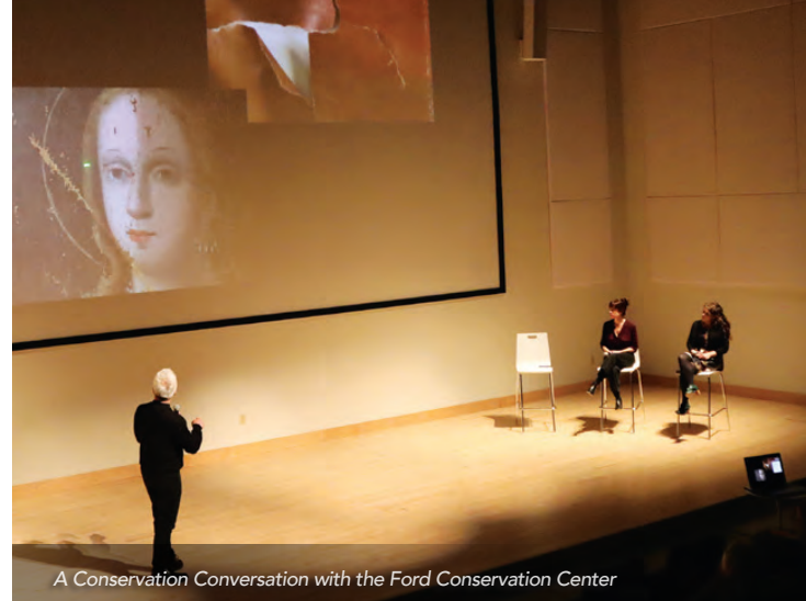
A Conservation Conversation with the Ford Conservation Center