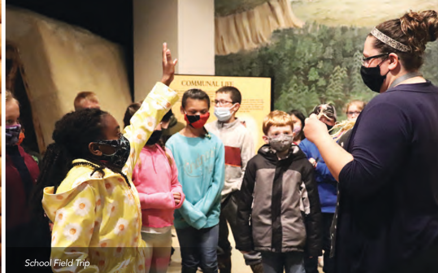
School Field Trip