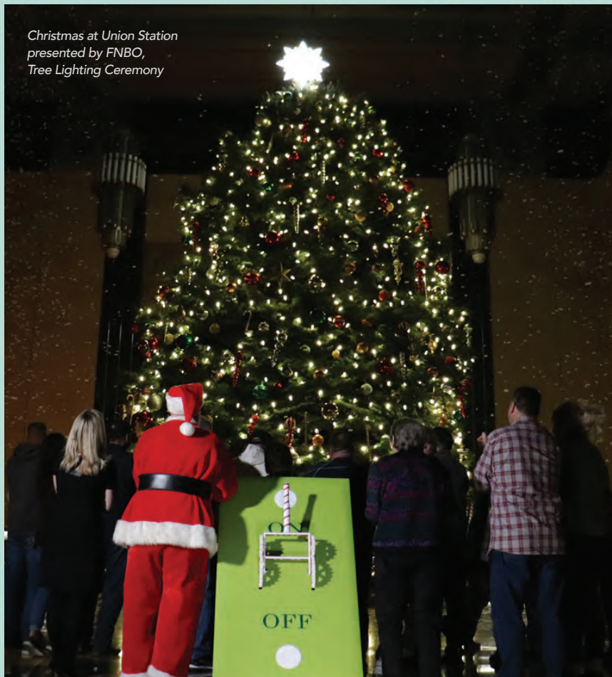
Christmas at Union Station presented by FNBO, Tree Lighting Ceremony