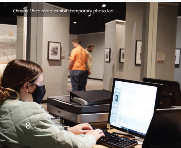
Omaha Uncovered exhibit: temporary photo lab