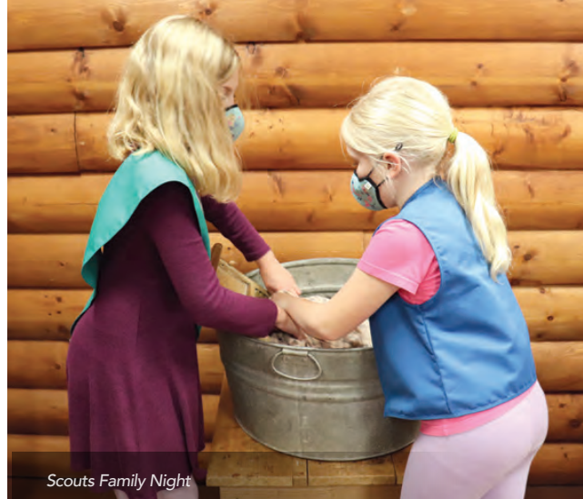
Scouts Family Night