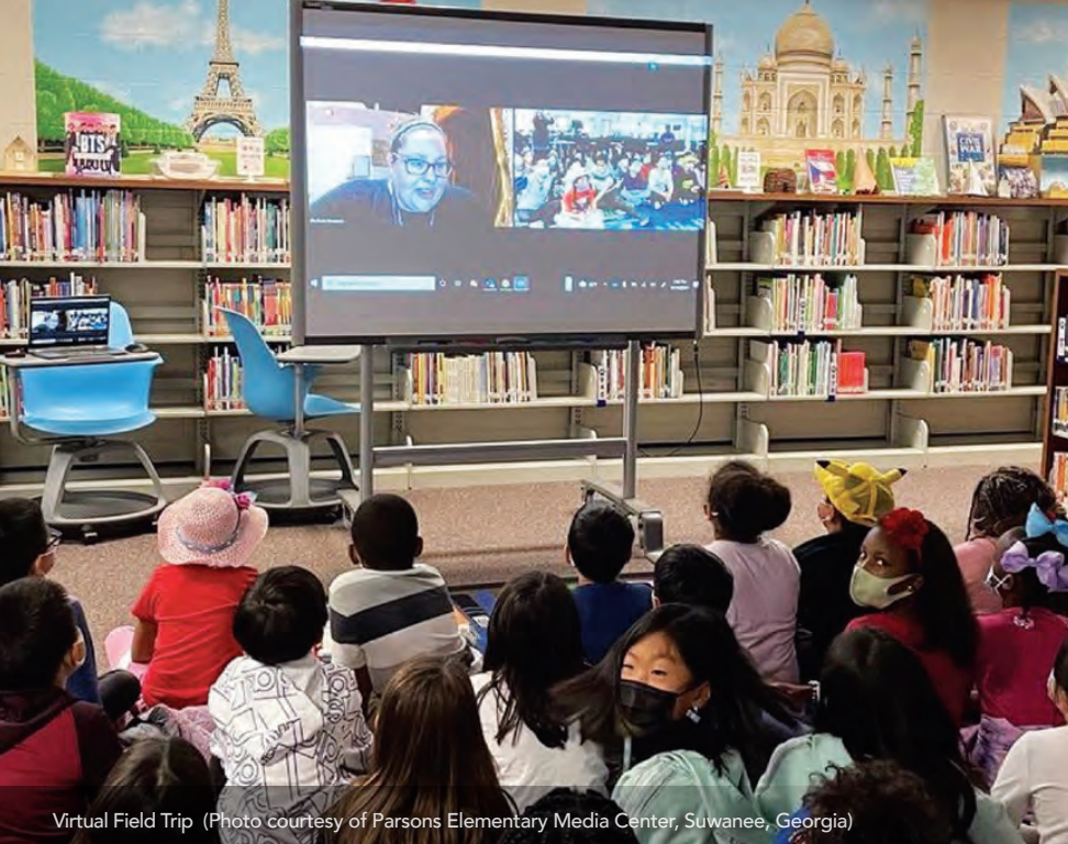
Virtual Field Trip