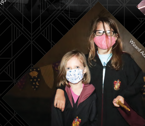
Wizard Academy week at Summer Camp