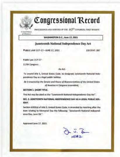
▲ Official announcement regarding the creation of Juneteenth as a National Holiday. Donated by the Office of U.S. Representative Don Bacon