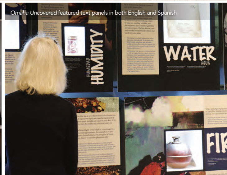
Omaha Uncovered featured text panels in both English and Spanish