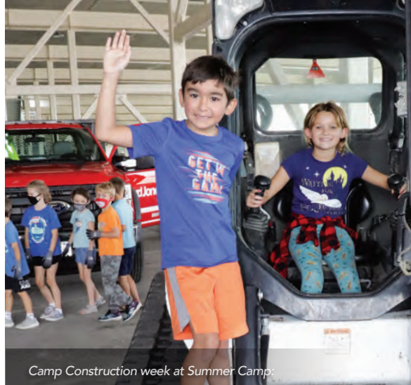
Camp Construction week at Summer Camp