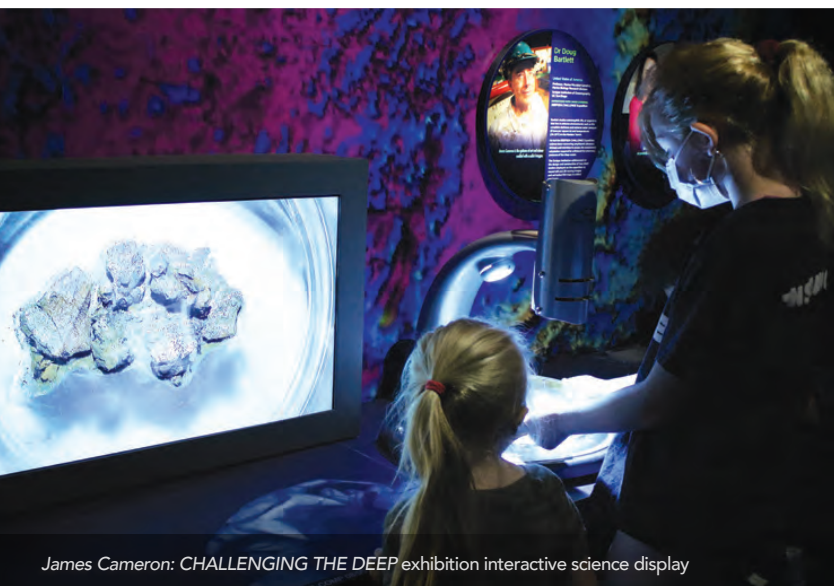
James Cameron: CHALLENGING THE DEEP exhibition interactive science display

The shifting landscape of the pandemic brought an exciting opportunity for The Durham's summer season as James Cameron: CHALLENGING THE DEEP made its North American debut in Omaha. The blockbuster exhibition, which focused on deep sea exploration and drew upon Cameron's box office hits The Abyss and Titanic , was a huge hit with museum guests. Adding to the fun was a complementary display exploring the history of the ocean liner era of passenger travel, boisterous summer camps, and a Deep Sea Fridays series featuring family-friendly, STEM-based activities. A mix of virtual and in-person lectures connected museum members and the public with Dr. Robert Ballard, the famous researcher credited with discovering the Titanic and Bismarck shipwrecks featured in the display, as well as a history of the Titanic 's fateful voyage and a conversation with the Woods Hole Oceanographic Institution. The summer also saw the return of popular public programs including our River City History Tours and Museum Insider Tours, which give guests a chance to explore museum collections not currently on display.