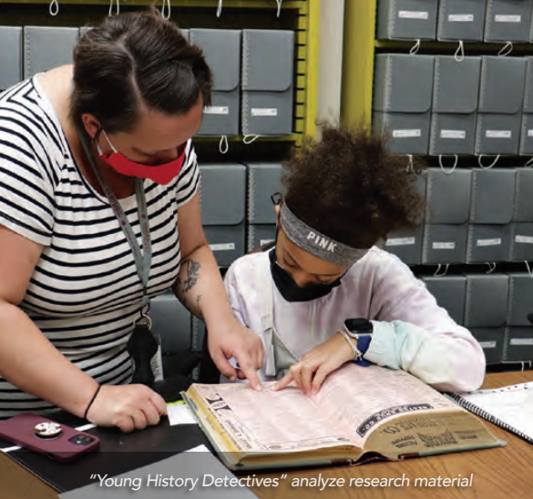
"Young History Detectives" analyze research material