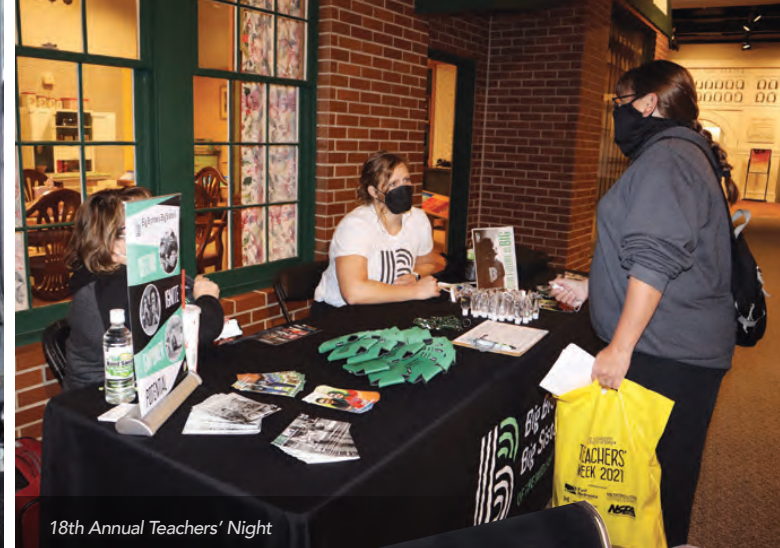
18th Annual Teachers' Night