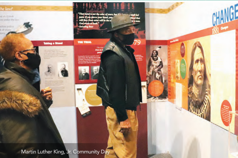
Martin Luther King, Jr. Community Day