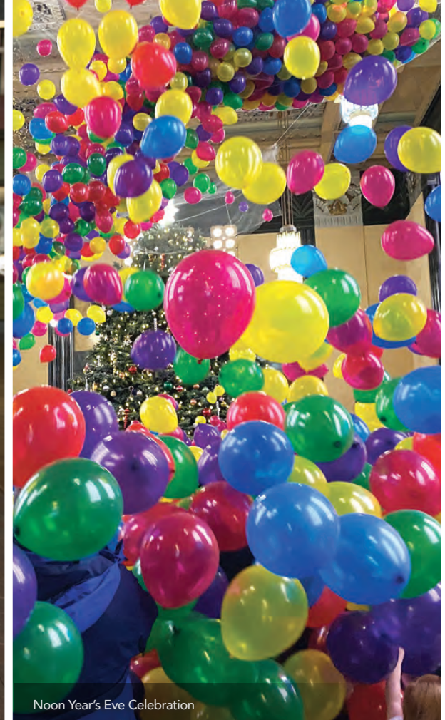
Noon Year's Eve Celebration

7,130 Household Memberships +1,400 members in the final 6 months of 2021