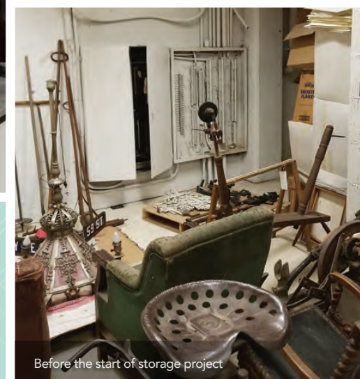
Before the start of storage project