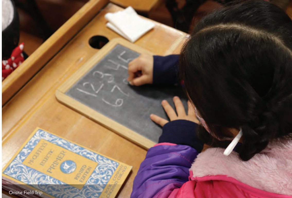
Onsite Field Trip