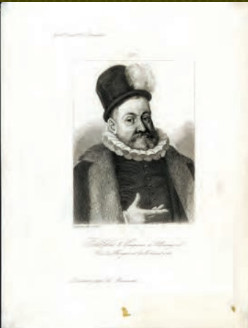
Photo: Portrait of Rudolph II, Holy Roman Emperor, (1576-1612), The Byron Reed Collection, 34.5 A