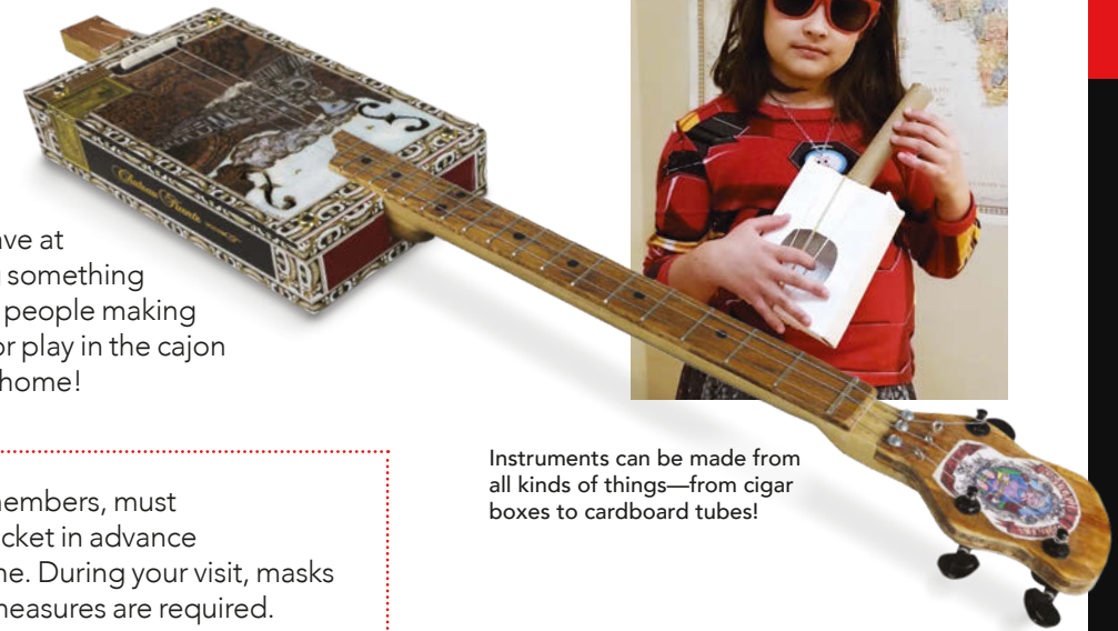
Instruments can be made from all kinds of things—from cigar boxes to cardboard tubes!