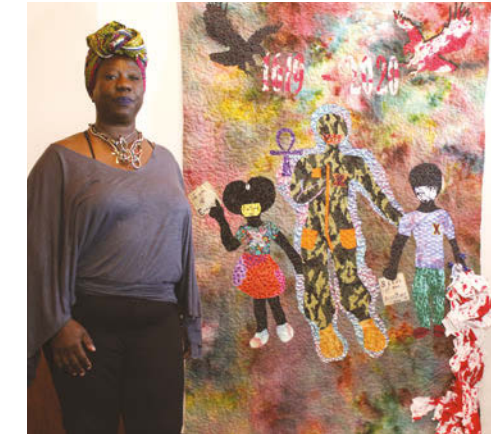
Along with historic images, the exhibit features contemporary artwork by local artists including Celeste Butler's "Enough: We are the Daughters of..."