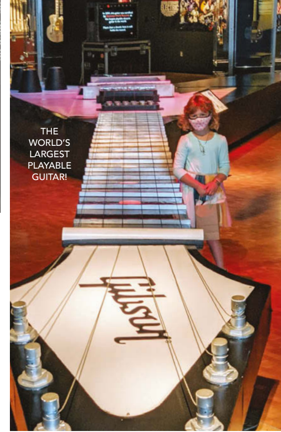
Lower & upper photos courtesy of Peoria Riverfront Museum