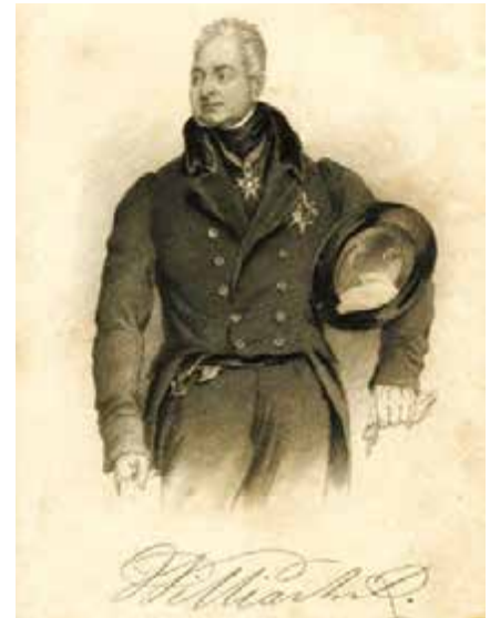
Photo: Portrait of William IV of England | 1765-1837 | | 25.6

Technology and political shifts allowed people to use clothing as a form of individual expression rather than an indication of social status. Clothing choices now provided insight into both public identities and private selves. This night-and-day change sparked revolutionary thought and represented equality among people. Who would have thought clothing could be so political?