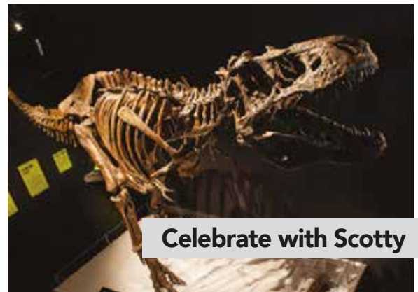
Celebrate with Scotty