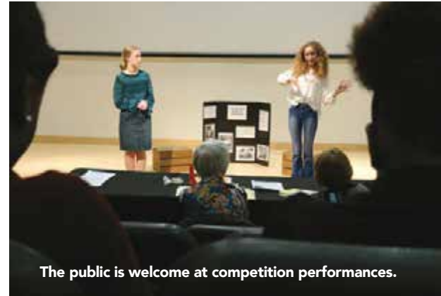
The public is welcome at competition performances.