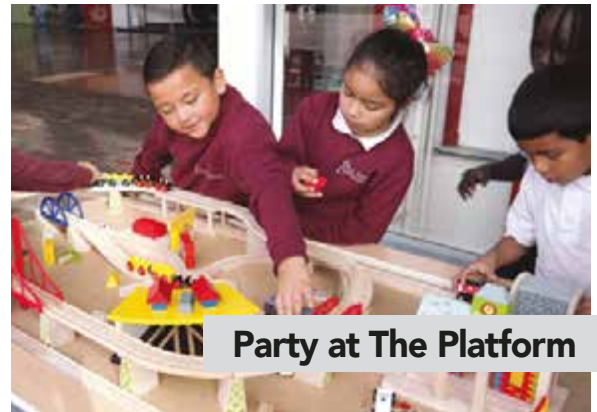
Party at The Platform